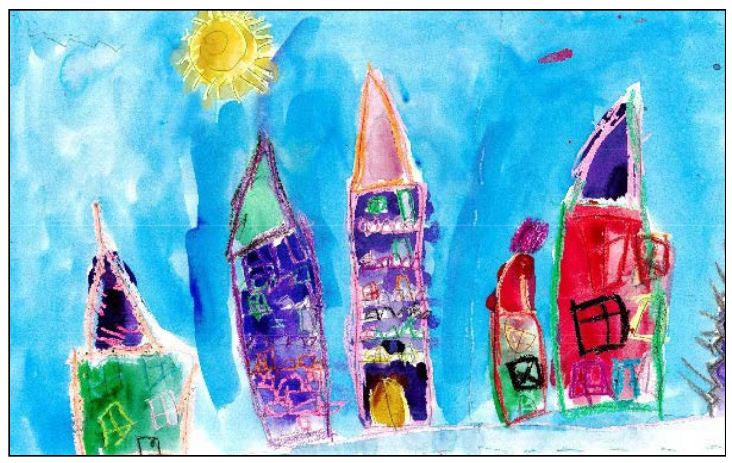
Carly, Willow Woods Elementary School