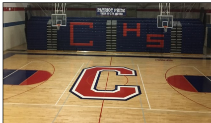
The gymnasiums at Cousino, Sterling Heights, and Warren Mott were recently refinished during the summer bond work. Additional work is expected to take place in the summer 2019.

The second shift of construction work at Black, Cromie, Green Acres, Lean, Siersma, and Susick Elementary Schools is slated for Summer 2019.