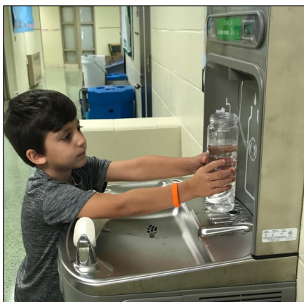
A Holden Elementary student fills up his water bottle at one of the new water bottle filling stations provided through the 2016 Bond.

The improvements were made possible through a $134.5 million bond proposal, which was approved by voters in May 2016, to preserve the district's facilities and remain com-