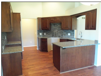
High end materials such as granite countertops were installed throughout the home.

The home boasts 1,723 square feet of living space and includes a spacious kitchen and nook, great room with vaulted ceiling, three bedrooms, two full bathrooms and a first-floor laundry. The home also includes a 1,600 square foot finished basement with living area, storage, a full-size bathroom, bedroom, and egress window.