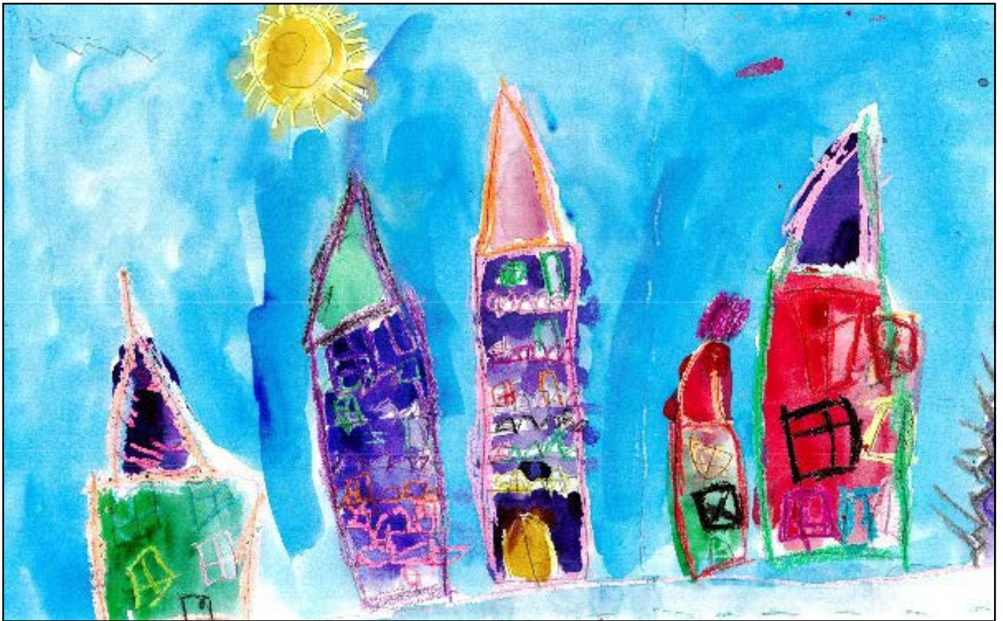
Carly, Willow Woods Elementary School