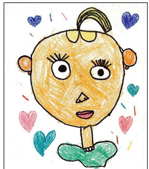
Prapthi, Susick Elementary School